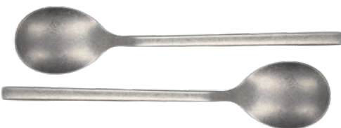
R5784F20154 Set 2 cucchiaio tavola 8056444472394 Set 2 dinner spoon cm 20,4* h 1* 4 (spessore 4 mm) 8" x h 1/2" x 1 1/2" (4 mm thick)