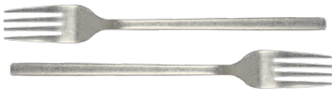
R5784F10154 Set 2 forchetta tavola 8056444472370 Set 2 dinner fork cm 20,4* h 1* 2,4 (spessore 4 mm) 8" x h 1/2" x 1" (4 mm thick)