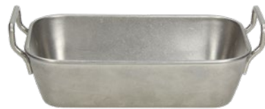
R5760P20154 Tegamino rettangolare con manici 8056444028102 Rectangular casserole cm 16,5* h 5* 10 6,5" x h 1,97" x 7 3/4"