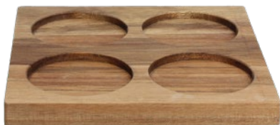
R5860P30154 Vassoietto 4 scomparti 8056444027822 4 sector tray cm 16* h 1,5* 16 6,30" x h 0,59" x 6,30"