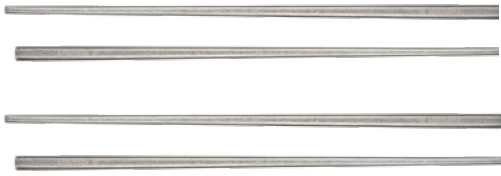
R5784F60154 Set 2x2 chopstick 8056444472479 Set 2x2 chopstick cm 23,5* h 7* 7 (spessore 7 mm) 9 1/4" x h 2 3/4" x 2 3/4" (7 mm thick)