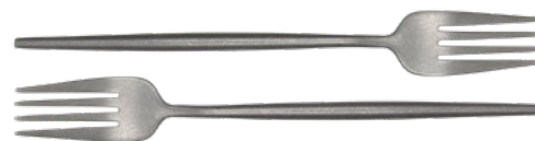
R5784F80154 Set 2 forchetta da tavolo skewer 8056444027594 Set 2 table fork cm 22* h 2,30* 2,70 (spessore 8 mm) 8,66" x h 0,91" x 0,59" (8 mm thick)