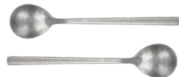
R5784F40154 Set 2 cucchiaio tè 8056444472851 Set 2 tea spoon cm 14,5* h 2,7* 1,5 (spessore 4 mm) 5 3/4" x h 1" x 3/4" (4 mm thick)