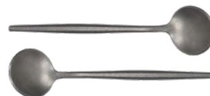
R5784G10154 Set 2 cucchiaino caffè skewer 8056444027709 Set 2 coffee spoon cm 12,70* h 1,5* 3 (spessore 8 mm) 3" x h 5" x 0,59" (8 mm thick)