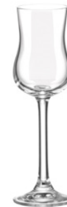
PARADOX - GRAPPA

PURE CRISTALIN FLAWLESS DESIGN MINIMUM THICKNESS PERFECTLY BALANCED