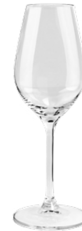
PARADOX - FLUTE

PURE CRISTALIN FLAWLESS DESIGN MINIMUM THICKNESS PERFECTLY BALANCED