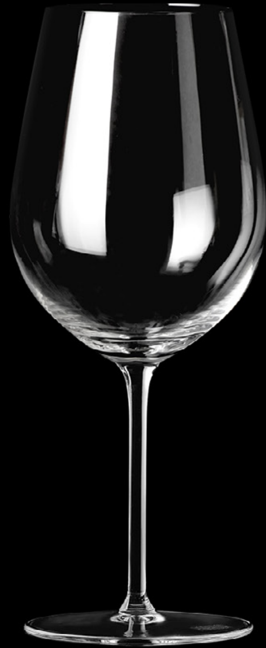
Red Wine 530 ml