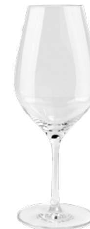
PARADOX - RED WINE

HIGHT 224 MM · TOP Ø51 MM MAX Ø78 MM · FOOT Ø76 MM