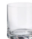
PARADOX - ROCKS 410 ML Ref. 45410 HIGHT 95 MM · TOP Ø90 MM FOOT Ø90 MM