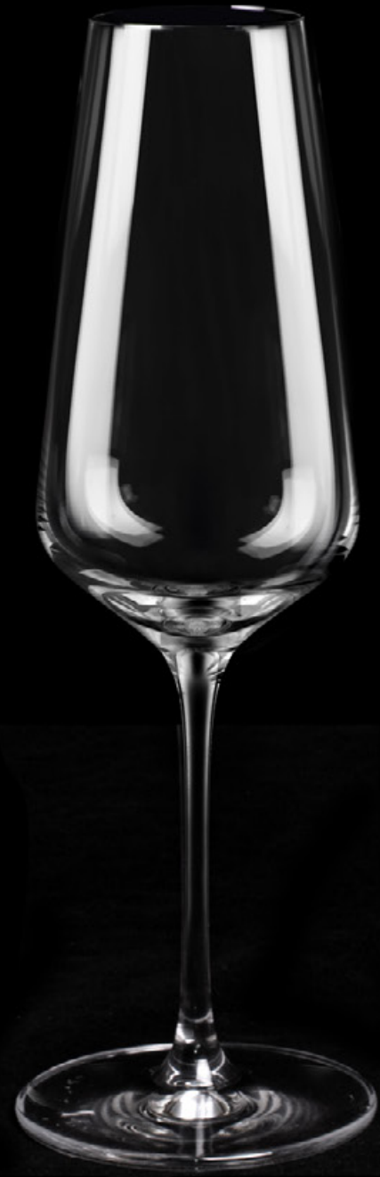
Flute 420 ml