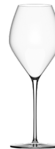
PARADOX - TASTING

HIGHT 256,5 MM · TOP Ø45 MM MAX Ø64 MM · FOOT Ø80 MM