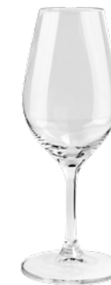
PARADOX - TASTING

HIGHT 235 MM · TOP Ø51 MM MAX Ø78 MM · FOOT Ø82 MM