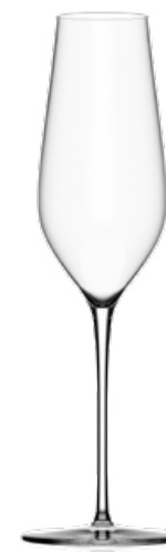
PARADOX - CHAMPAGNE

PURE CRISTALIN FLAWLESS DESIGN MINIMUM THICKNESS PERFECTLY BALANCED