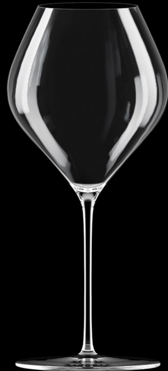
Burgundy 630 ml