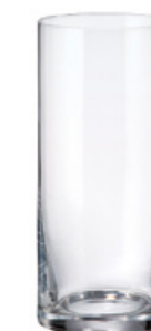
PARADOX - HIBALL 470 ML Ref. 45470 HIGHT 160 MM · TOP Ø71 MM FOOT Ø71 MM