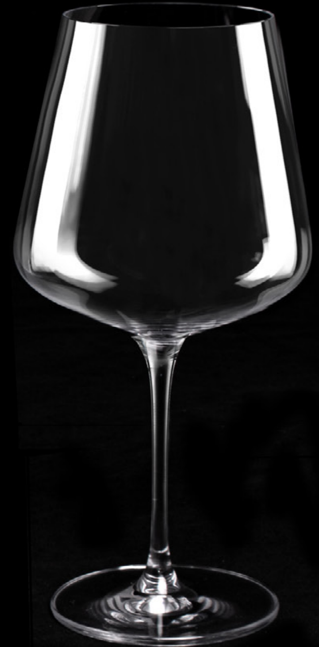
Burgundy 770 ml