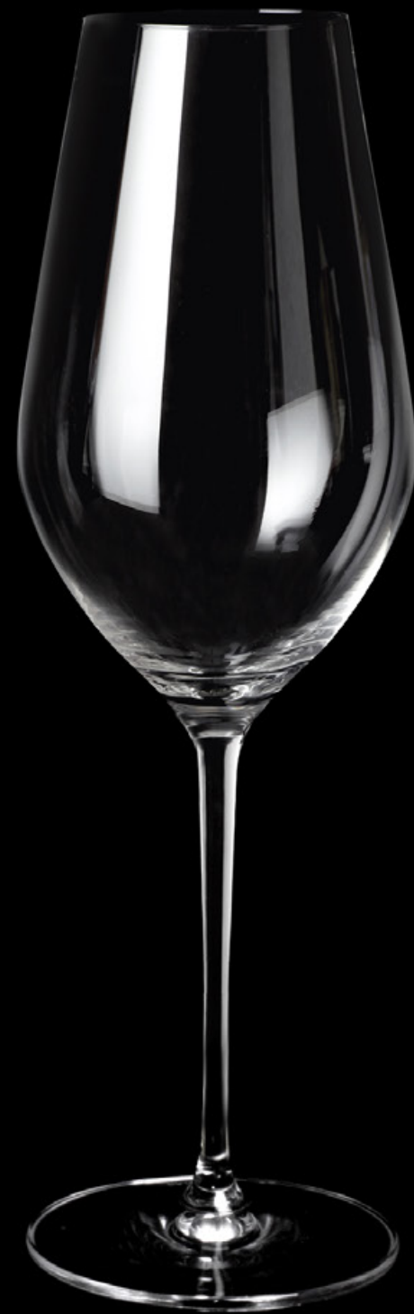
Flute 240 ml