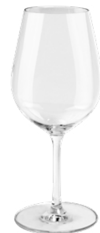
PARADOX - RED WINE

PURE CRISTALIN FLAWLESS DESIGN MINIMUM THICKNESS PERFECTLY BALANCED