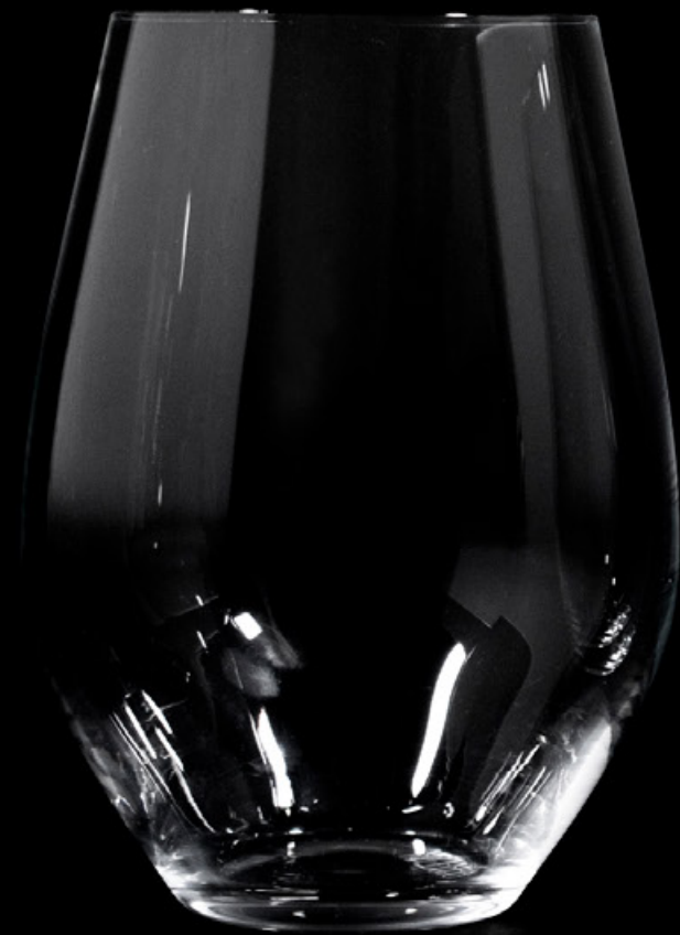
Water Tumbler 400 ml