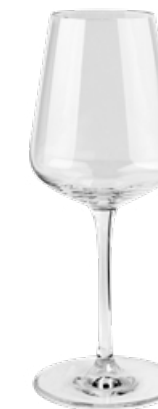
PARADOX - WHITE WINE

HIGHT 246 MM · TOP Ø48 MM MAX Ø71 MM · FOOT Ø82 MM