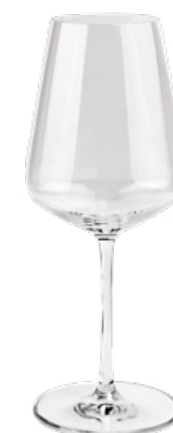
PARADOX - RED WINE

HIGHT 227 MM · TOP Ø59 MM MAX Ø84 MM · FOOT Ø82 MM