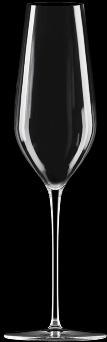
Flute 295 ml