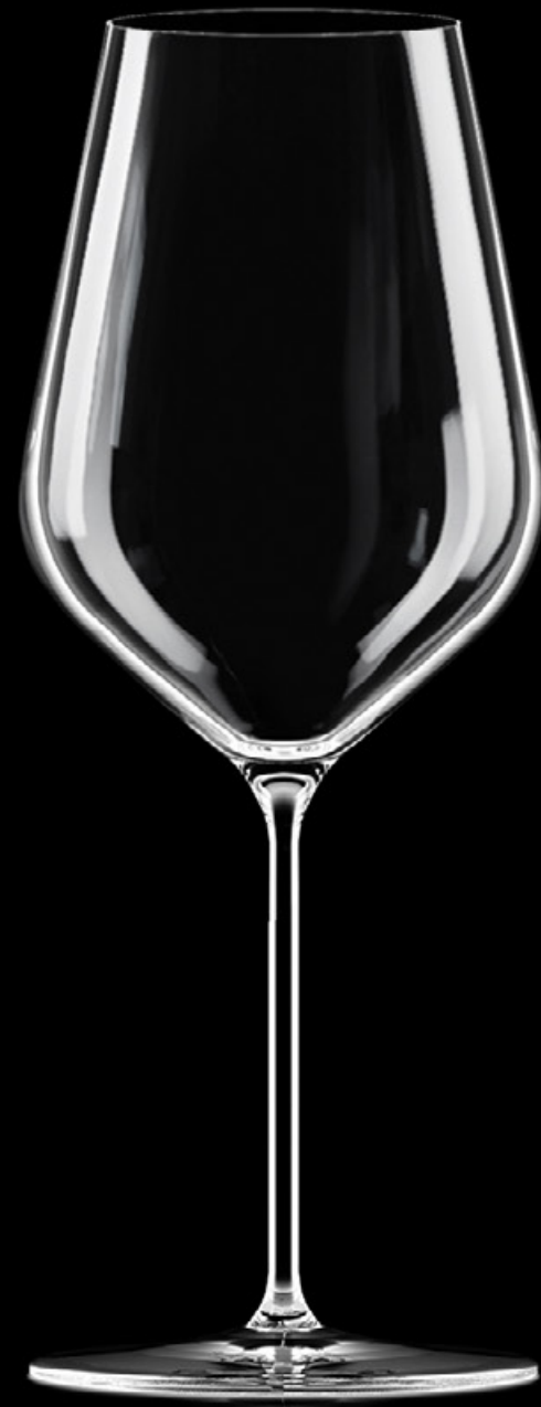
Tasting 470 ml