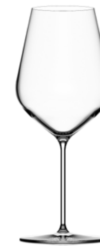
PARADOX - MAGNUM

HIGHT 248 MM · TOP Ø65,5 MM MAX Ø96 MM · FOOT Ø94 MM