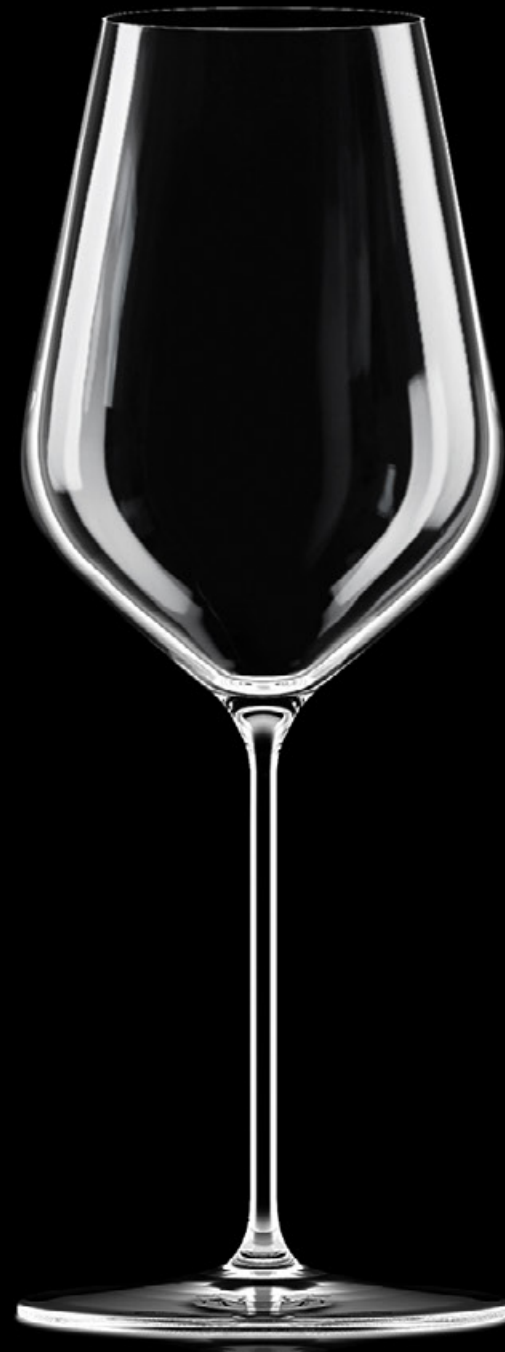
Bordeaux 580 ml