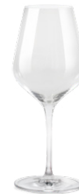
PARADOX - WHITE WINE

HIGHT 239 MM · TOP Ø48 MM MAX Ø65 MM · FOOT Ø72 MM