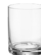
PARADOX - AGUA 320 ML Ref. 45320 HIGHT 99 MM · TOP Ø80 MM FOOT Ø78 MM