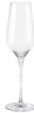
PARADOX - FLUTE

PURE CRISTALIN FLAWLESS DESIGN MINIMUM THICKNESS PERFECTLY BALANCED