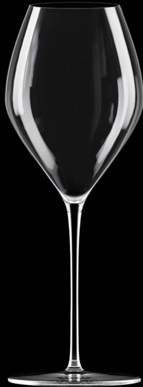
Tasting 450 ml