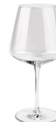
PARADOX - BURGUNDY

HIGHT 247 MM · TOP Ø69 MM MAX Ø106 MM · FOOT Ø88 MM