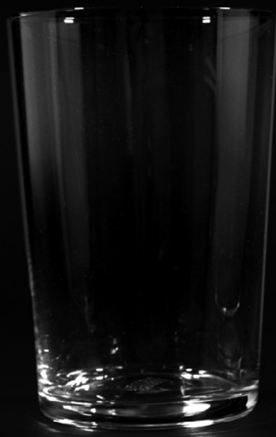
Caña Tumbler 250 ml