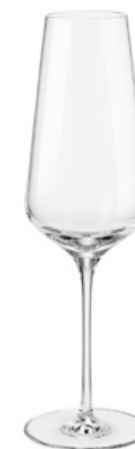
PARADOX - FLUTE

PURE CRISTALIN FLAWLESS DESIGN MINIMUM THICKNESS PERFECTLY BALANCED