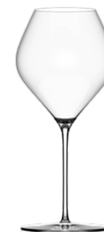
PARADOX - BURGUNDY

HIGHT 260 MM · TOP Ø64 MM MAX Ø101 MM · FOOT Ø94 MM