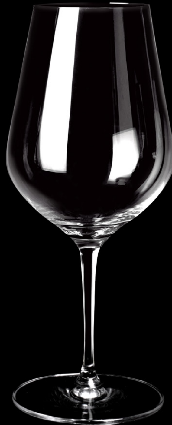
Red Wine 540 ml