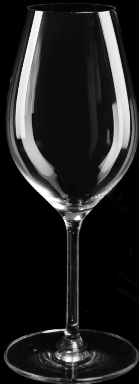
Tasting 350 ml