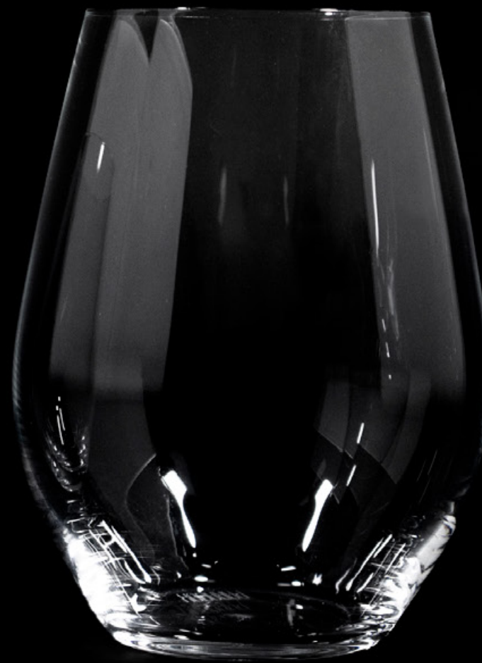
Water Tumbler 580 ml