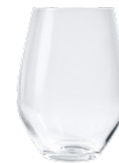
PARADOX - WATER

PURE CRISTALIN FLAWLESS DESIGN MINIMUM THICKNESS PERFECTLY BALANCED